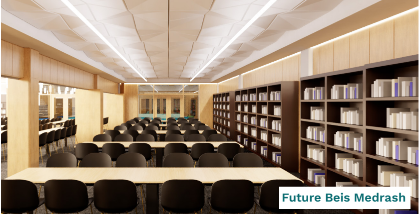
Future Beis Medrash