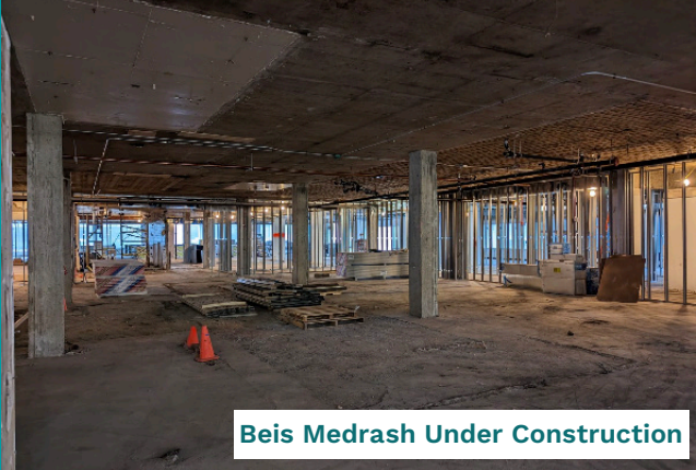
Beis Medrash Under Construction

The Share Our Future Campaign presents a historic and exciting opportunity to ensure the viability of Arie Crown Hebrew Day School now and for the future. This landmark project will allow us to meet the need for a new school building and ensure that we are able to provide our growing school community with the highest standards in education now and for generations to come. Throughout the year, we will highlight the ways in which our school excels and how our new space will allow us to enhance our education even further!